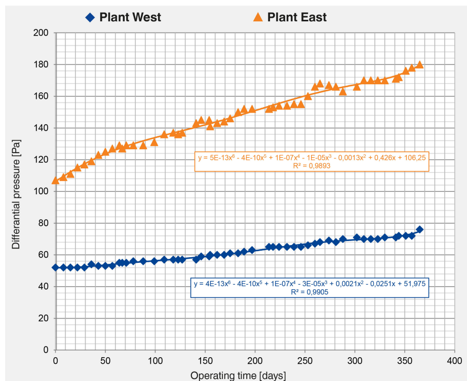
Fig. 1: Graph showing all recorded measurement data

The final measurements at the end of the test showed clear differences: the NanoWave® filter (76 Pa) exhibited a differential pressure of just under 60% compared to the standard filter (180 Pa); the average differential pressure over the running time was 146.9 Pa for the standard filter and just 61.8 Pa for the NanoWave® (cf. Fig. 1).